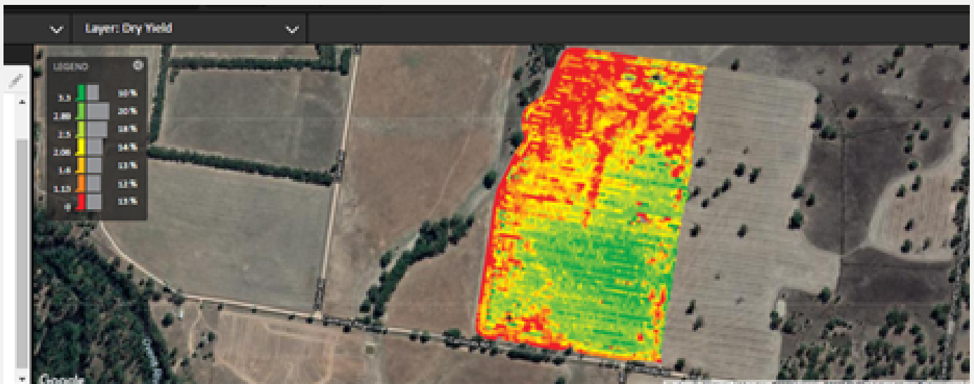
Figure 1. Yield Map Irrigated Canola Paddock.