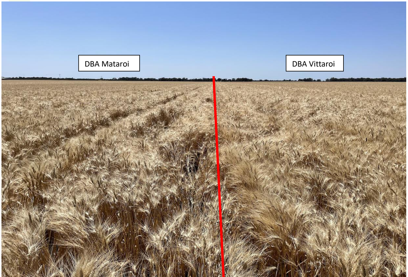
Figure 4. Both varieties at harvest. DBA Mataroi standing on average 16cm taller than DBA Vittaroi