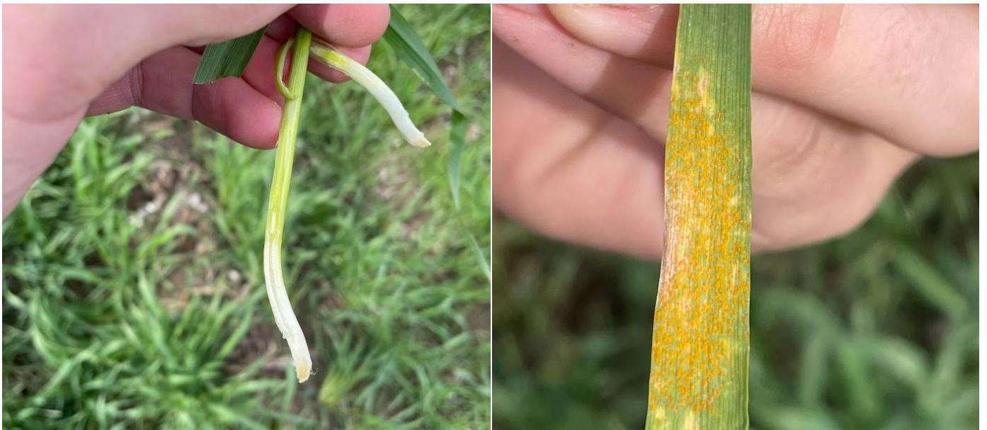
Figure 3. Both varieties at Z31 (first node detectable) and expressing an early infection of stripe rust